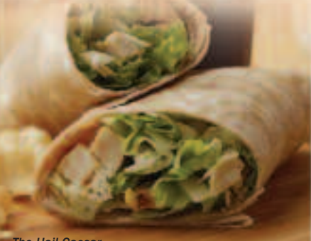
The Hail Caesar

THE FATTY - Grilled chicken steak with North America's best wing sauce & creamy bleu cheese dressing 6.99