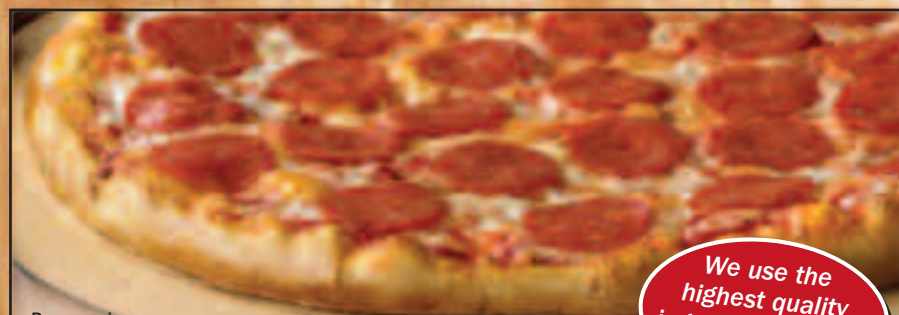
Pepperoni & Cheese Pizza